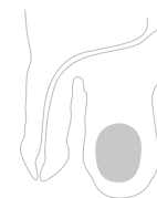
Scrotum - The skin sack that holds the testicles

daily be applied when initiating scrotal application. Many men experience a warming sensation of the scrotal skin for a few minutes after applying ANDROFORTE® 5 – this is normal and quickly subsides. No perfume, deodorant or moisturizing creams or gels should be used on the area because this may interfere with ANDROFORTE® 5 from being absorbed. Never apply the cream to broken or damaged skin. ANDROFORTE® 5 cream should be applied at approximately the same time each day.