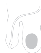
Scrotum - The skin sack that holds the testicles

is greatest from this part of the body. Many men experience a warming sensation of the scrotal skin for a few minutes after applying ANDROFORTE® 2 – this is normal and quickly subsides. No perfume, deodorant or moisturising creams or gels should be used on the area because this may interfere with ANDROFORTE® 2 being absorbed. Never apply the cream to broken or damaged skin. ANDROFORTE® 2 cream should be applied at approximately the same time each day. It is recommended that patients do not swim or shower until at least one hour after application of ANDROFORTE® 2 cream. Close skin contact with the area of application within an hour of application by a partner should be avoided. This may result in the partner absorbing some testosterone via skin contact.